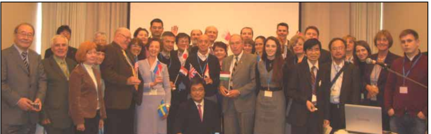
The participants of Session 1