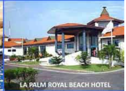
LA PALM ROYAL BEACH HOTEL