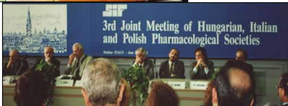
Middle: Panelists at the 3rd Joint Meeting of the Hungarian, Italian and Polish Pharmacological Societies