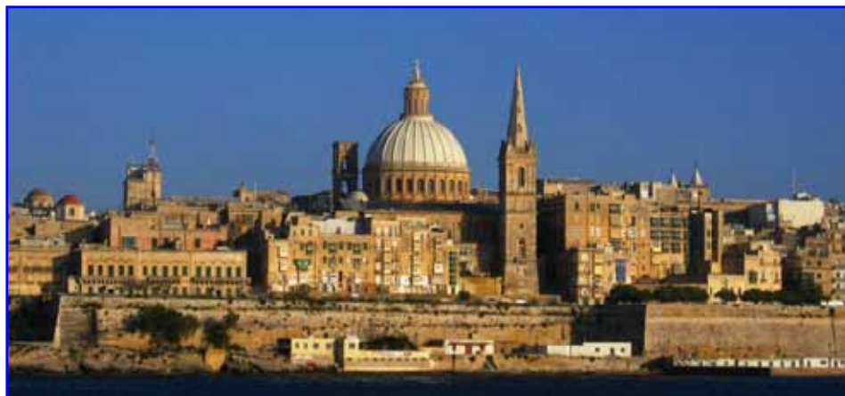
Valletta, the capital city of Malta

The Department of Clinical Pharmacology and Therapeutics also works closely with the Medicines Authority in Malta, with faculty from the department having been appointed as experts