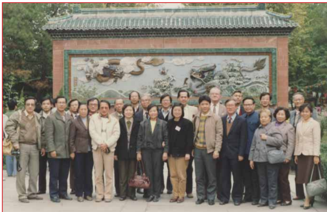
HKPS delegates at the Guangdong Pharmacological Society Scientific Meeting, Guangzhou, China, December 1986