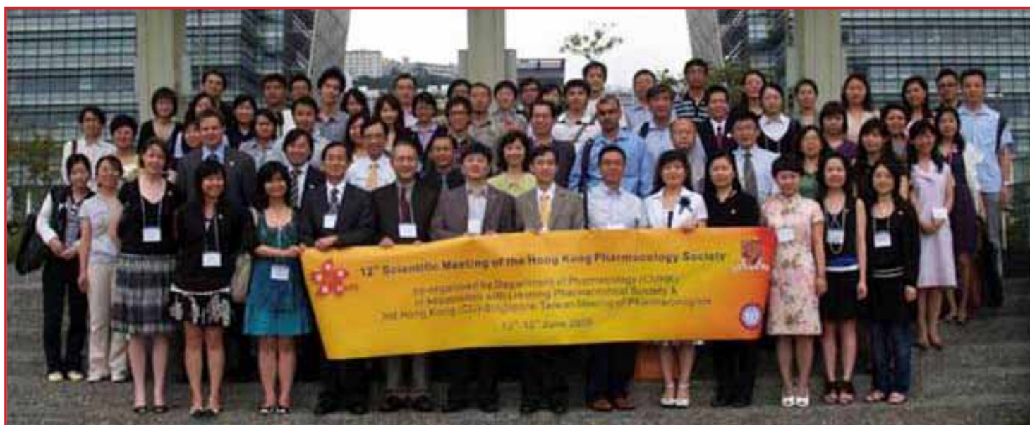
Delegates at the HKPS-hosted conference in June 2009

Sciences. In these changing times, the HKPS provides a forum for those of us who still believe strongly that the integrated scientific approach, which is the hallmark of training in pharmacology, is essential for successful drug development and patient care. To achieve this goal we sponsor seminars throughout the year and actively encourage attendance by our student members to increase their exposure to new areas of research. We also provide travel grants to encourage the newer generations of pharmacologists to experience the thrill of presenting their research work to an international audience.