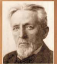
Third Hans Horst Meyer Award 2007