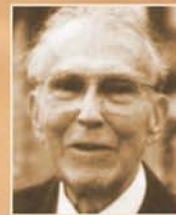
First Heribert Konzett Award 2007