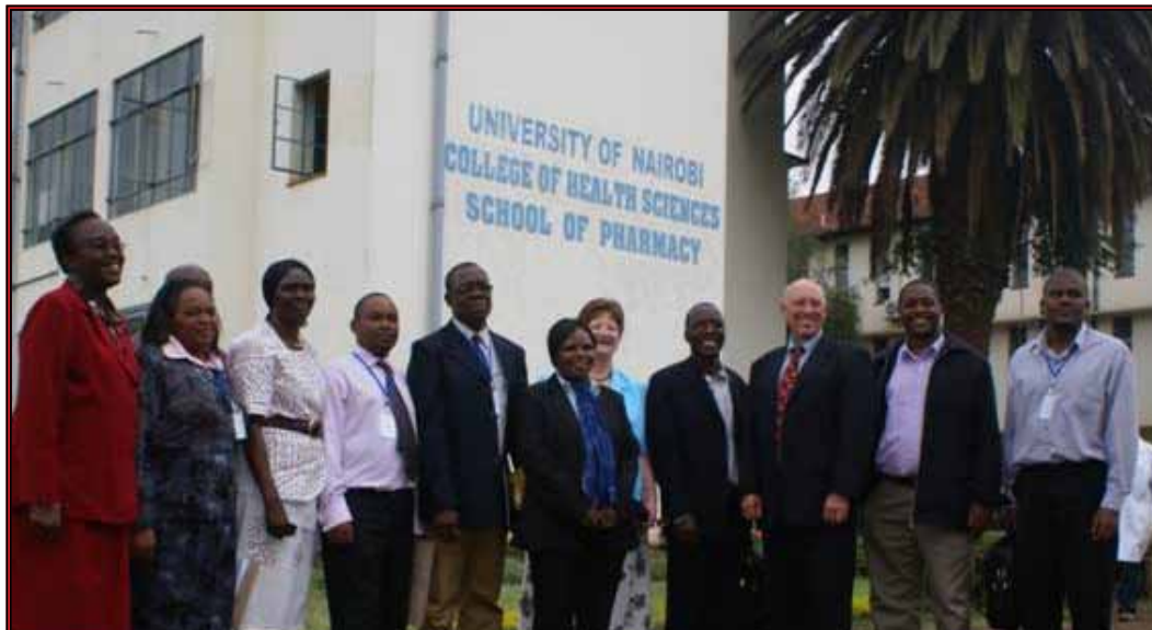
A group photograph of the international and local facilitators

The 19 participants from six African countries were either pursuing or held post graduate specialization in pharmacology and/or toxicology, or a closely related field, and worked in a teaching or research institution.