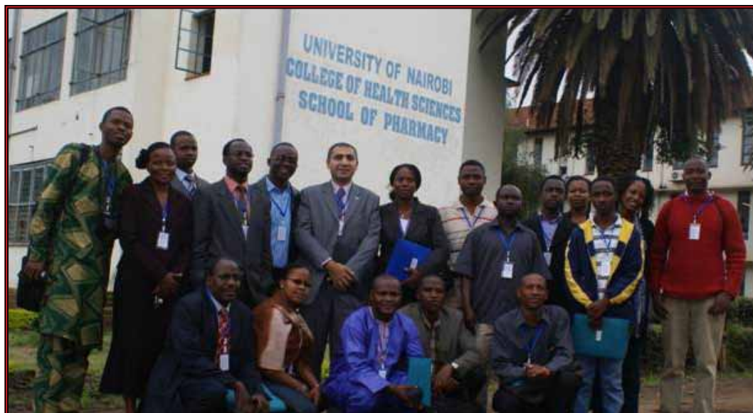
A group photograph of the workshop participants

The 19 participants from six African countries were either pursuing or held post graduate specialization in pharmacology and/or toxicology, or a closely related field, and worked in a teaching or research institution.