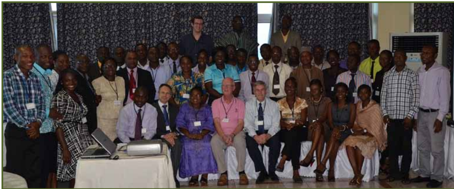
Some of the delegates who participated in the Accra, Ghana workshop on Pharmacovigilance - Communication & Crisis Management Public Health: A Focus on Patient Safety

participants agreed that the peer interactions and discussions were important elements of the workshops. The application of e-learning training technologies utilized during the Abuja workshop was a milestone event in distance learning for pharmacology and will be widely applied in the future. The continuation of these workshops is considered to be critical for the future of pharmacology on the Africa continent. The participants expressed keen interest in the next series of courses in conjunction with the 17 th IUPHAR World Congress of Basic and Clinical Pharmacology to be hosted in Cape Town, South Africa in 2014. •