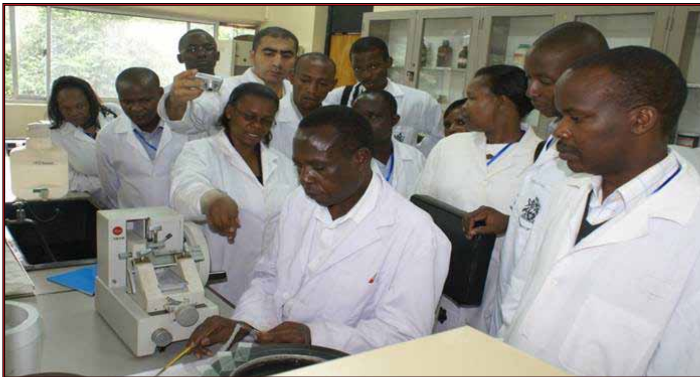
A demonstration of using microtome to make tissue sections for histological examination

The hands-on training in specific skills focused on good animal husbandry and handling techniques; quality control in in vitro systems and animal models for toxicological investigations; GLP and toxicity testing; challenges in the regulatory requirements for acute toxicity testing; acute and chronic toxicity of different compounds; hematological and biochemical tests on animal blood, urine and CSF; histological examination of animal tissues; organ harvesting; tissue fixation; and microtome use. In post-meeting evaluations, the participants highly rated the contents and format of the workshop.