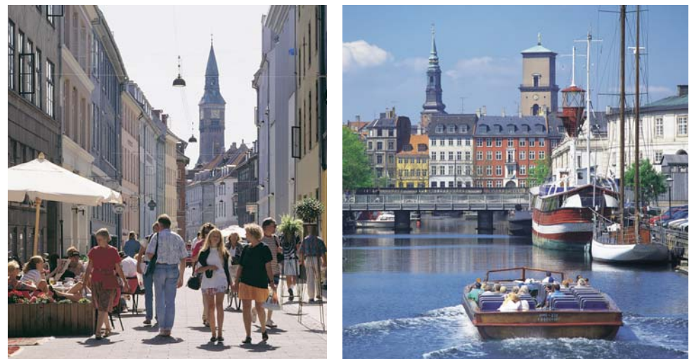
Layout: Christian Tofte. Printed in Denmark by P.J. Schmidt Grafisk Produktion